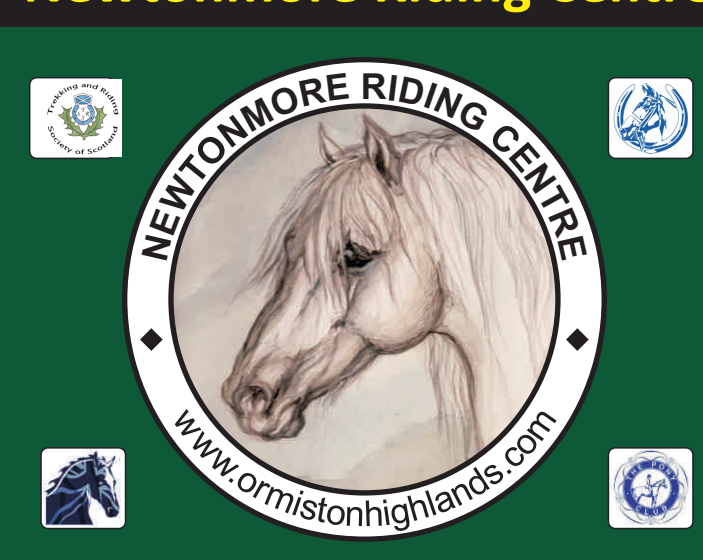
Approved by: BHS • ABRS • TRSS • The Pony Club